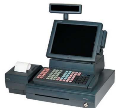
Real mount customer pole display