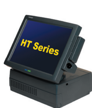
2-in-1 MSR and finger print sensor

Cable management design allows easy routing of cables for aesthetics and safety measures.